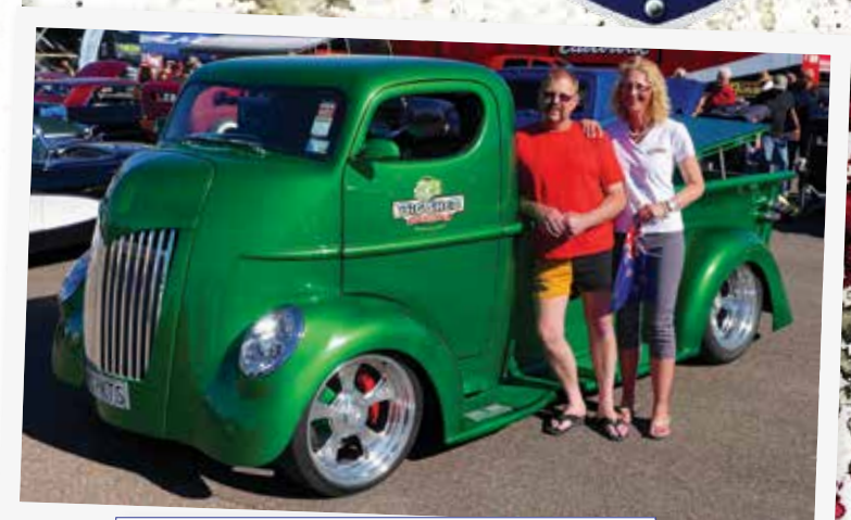
The happy couple realising that all their dreams had come true.