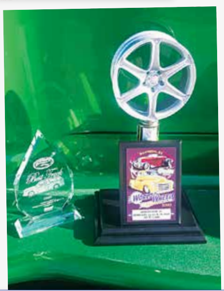
Subsequent Show Awards at the World of Wheels Custom Auto Show in Birmingham, Alabama. 1st place - ISCA Total Custom (International Show Car Association) and 1st place - Best Truck